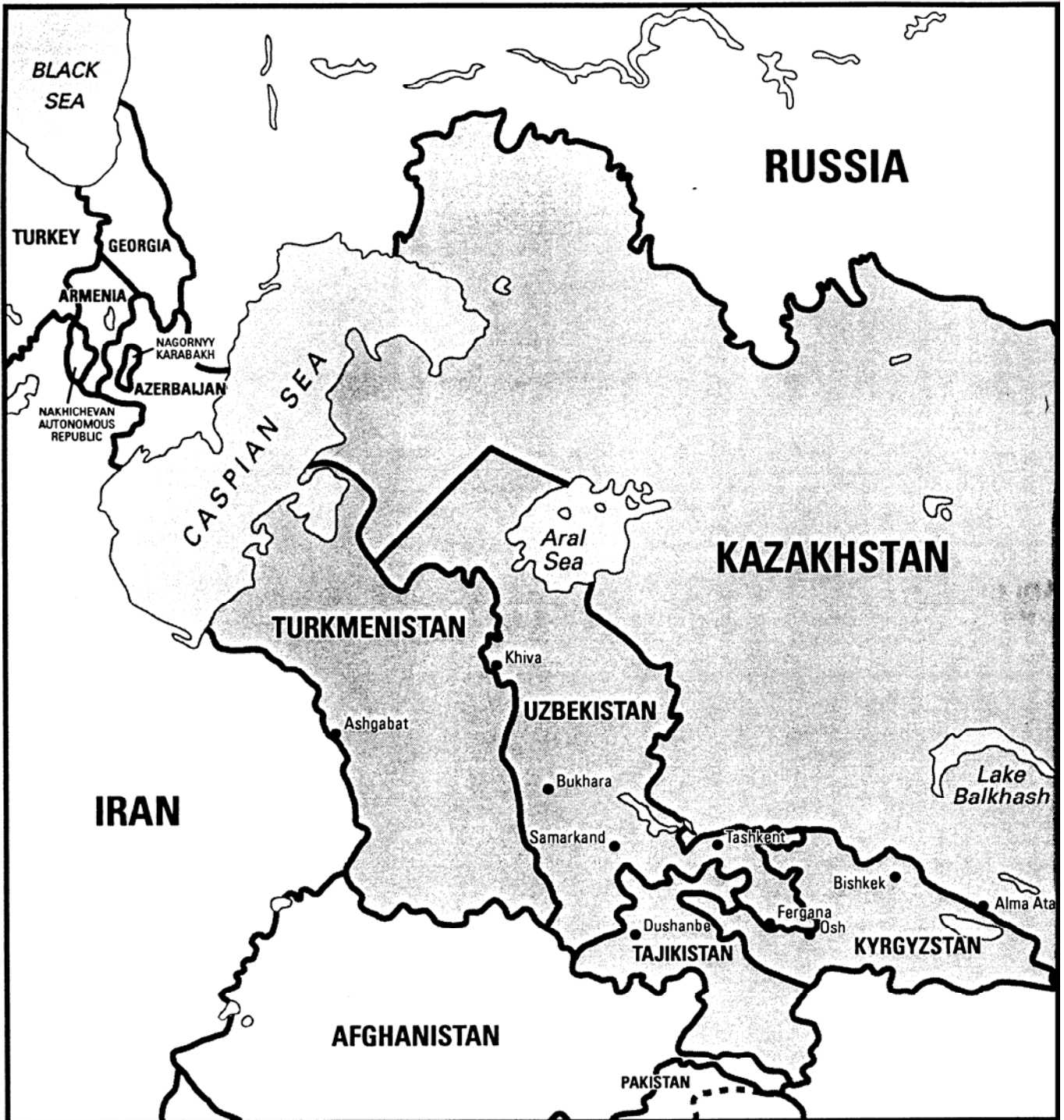
General Staff Map Section GSGS 11790 (CAD), Edition 5-GSGS, October 1993 1041/93 Boundary representation is not necessarily authoritative.