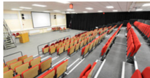
DCC Conference Hall