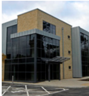
The linked accommodation annex