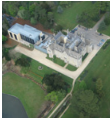
Beckett House and surroundings