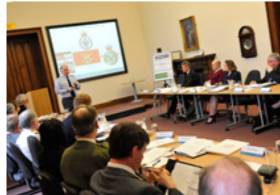
A seminar room at Beckett House